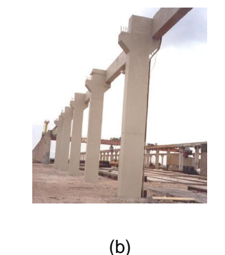
Figure 5: (a) Cleaning of the surface by water jetting; (b) Superficial coating with paint