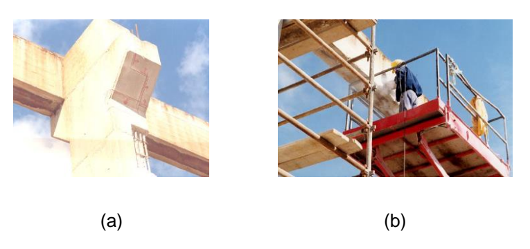
Figure 2: Surface preparation: a) marking of perimeter of the zones to remove; b) sawcutting of the marked perimeter

First of all, the delaminated areas are identified using a hammer, knowing that when they are tapped and sound hollow this indicates the presence of delaminated concrete. After that, the perimeter of the area to repair is marked, keeping in mind that the tracing should be as simple and uniform as possible, refraining from marking excessive corners and acute angles (Figure 2a). After that, the sawcutting of the marked perimeter is performed, trying not to damage the reinforcements (Figure 2b).